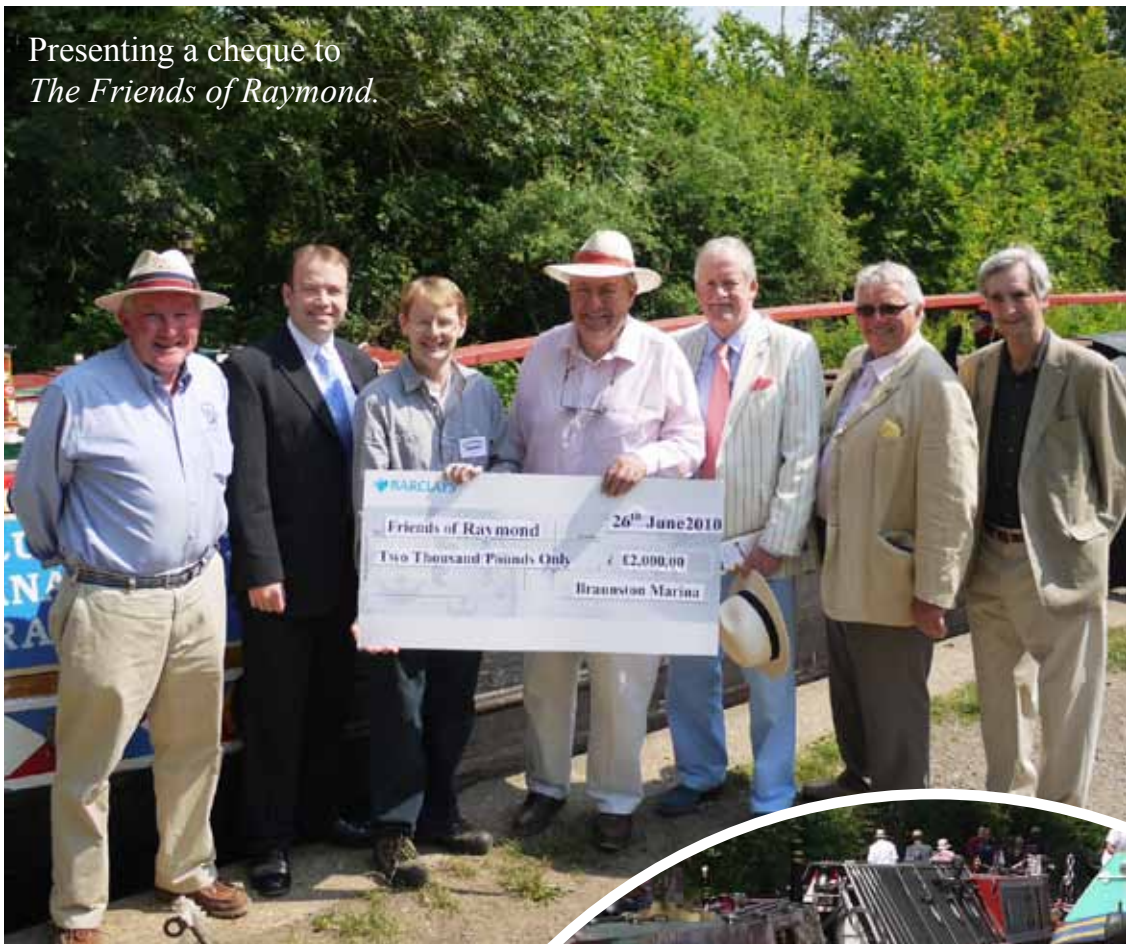
Presenting a cheque to The Friends of Raymond.

It was all in all an awesome sight to behold, which simply thrilled the 7,000 or so visitors, some coming from as far afield as Canada, the USA, South Africa and Australia especially for the event. The real bonus was when the boats paraded, which is what makes our rally unique and so special.