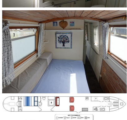
Not to scale